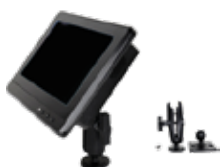
Ball-head bracket installation