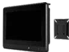
Wall mounted installation